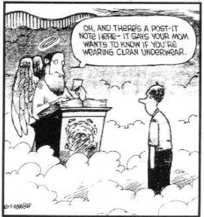
from JoyfulNoiseletter.com Reprinted with permission